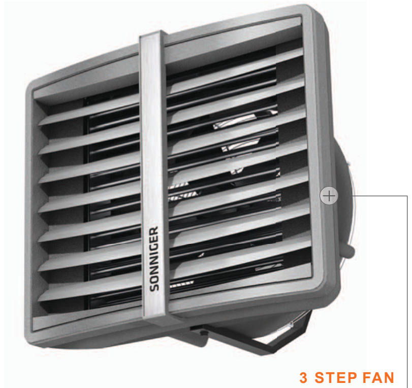
3 STEP FAN as standard supply